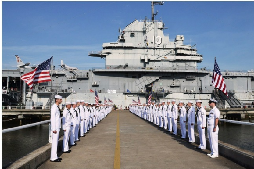
PATRIOTS POINT NAVAL & MARITIME MUSEUM

For those of you who are members of the American Legion (but you don't have to be a member), the United States Mint is issuing a set of commemorative coins recognizing the 100 th anniversary of the American Legion on March 14 of this year. There are several different offerings from gold coins, silver coins and clad coins individually or combined in sets. Pricing will be accordingly (as of this writing the prices have not been posted). The mint usually places these on sale at noon of the day of offering (3/14). If interested, please go to the mint's web site at the following: www.usmint.gov . You can order online with a credit card.